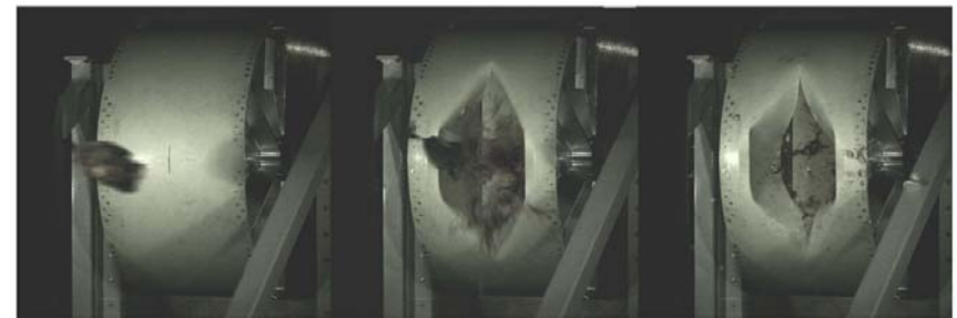
Figure 2: The video images show a typical bird impact on a generic or idealised leading edge aircraft structure. Tests were performed to 'calibrate' a numerical model of the test event. This approach enables certification of leading edge structure based on validated models rather than tests using expensive aircraft test sections.